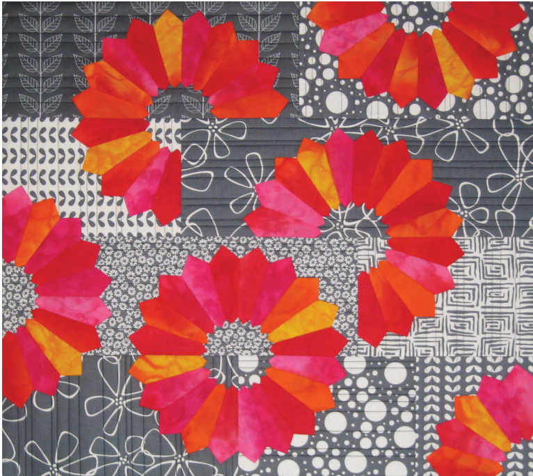
Disappearing Dresdens - 18 degrees (work from pattern or Dynamic Dresdens book)