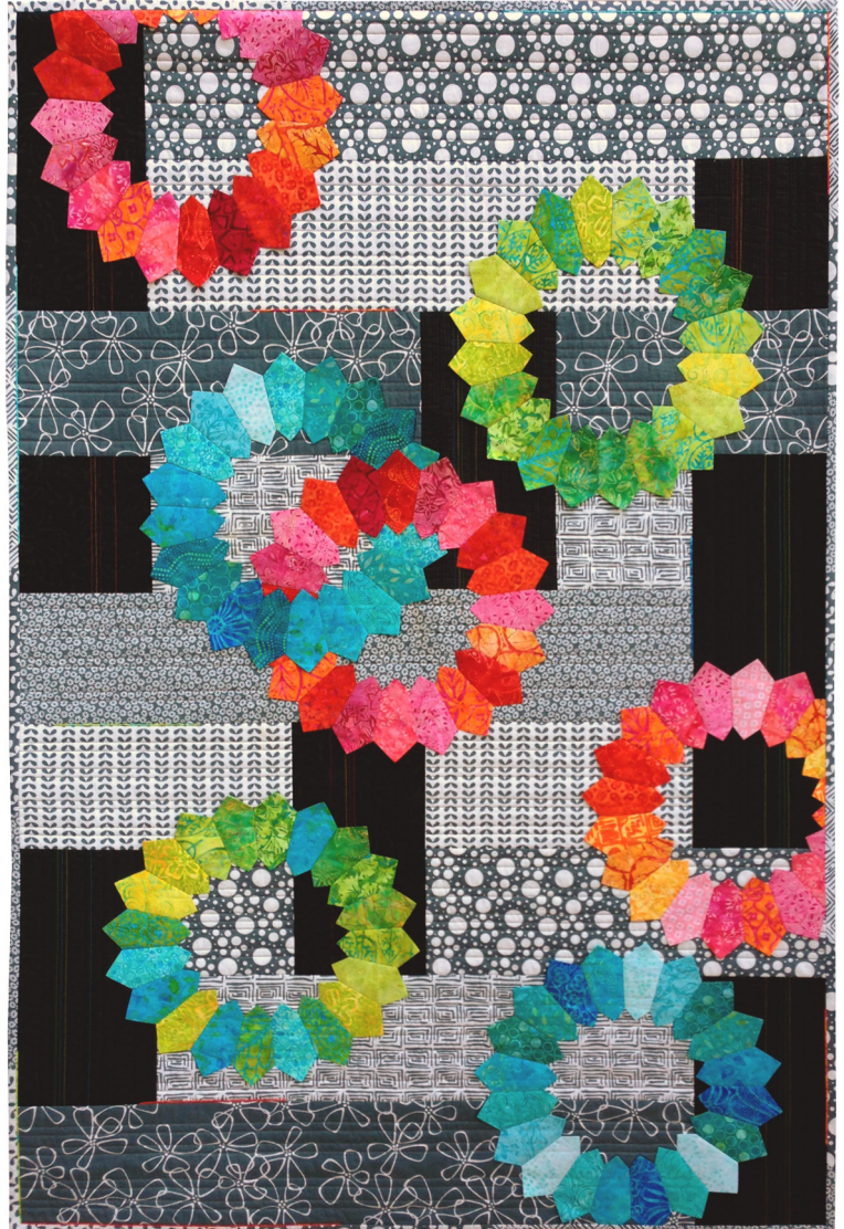
Ringie Dingie | 18° option

Double points put a contemporary spin on this long-time favorite and eliminate the need for an appliqued circle in the center. This allows rings to interlock! These Dresdens are built on a foundation so background fabrics don't shadow through and, more importantly, Dresdens turn out perfectly flat. Learn Susan's tips for speedily turning wedge points with the Prairie Pointer Tool. At home you may finish the quilt by quilting the background then ditch stitching Dresdens onto the quilted quilt! Design possibilities are endless! Finished quilt is 48"x 71".